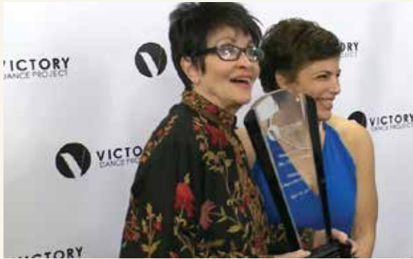
Victory Dance project Gala highlights with Chita Rivera