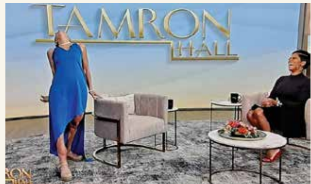
This Dancer didn't let a tragic bus accident stop her shine— Tamron Hall