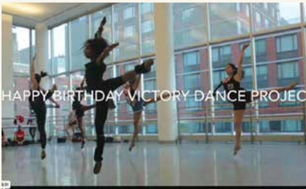
Victory Dance Project Anniversary