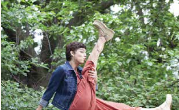
Making the Impossible Possible With the Power of Movement— Dance Magazine