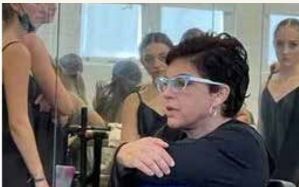
New Movie documents Palm Beach Gardens dancer's "Victory" despite blindness, crushed leg