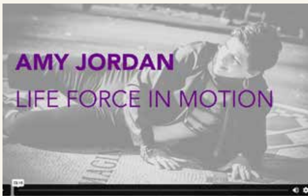
Victory Dance Project Vision