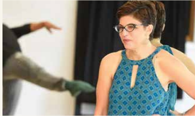
Dancer returns to stage after her leg was crushed by a bus— New York Post