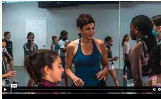
Victory Dance Project Master Classes