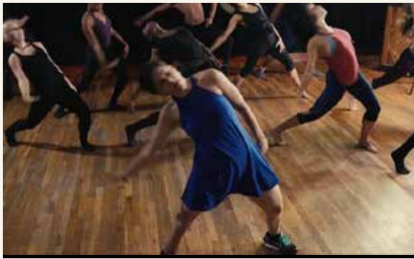
What Does Victory Mean to You? Presented by The Victory Dance Project