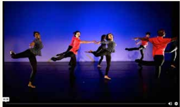
Victory Dance Project Performance