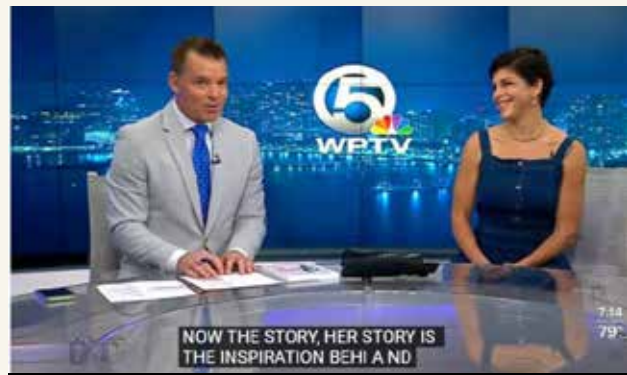
"Amy's Victory Dance" Movie Interview— WPTV