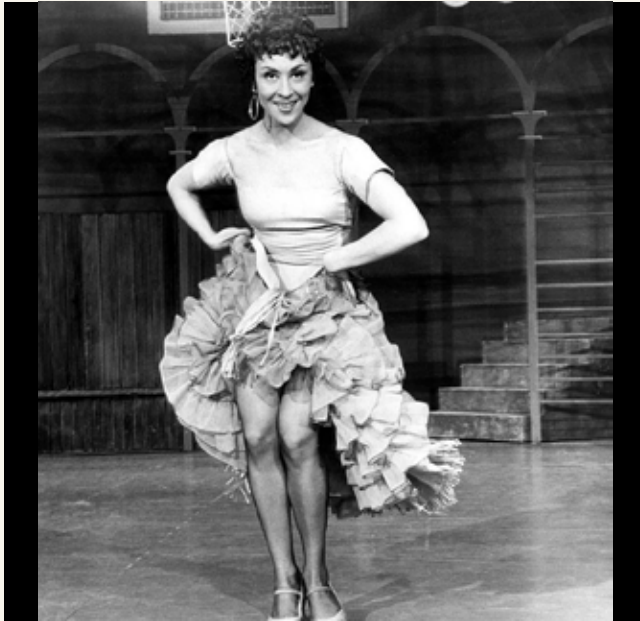
Ms. Chita Rivera –The 2017 Victory Dance Project recipient, the illustrious Ms. Chita Rivera embodies everything about being a ‘Woman of Valor.’